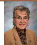
Senator Betty Olson (R)