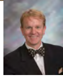
Senator Ried Holien (R)