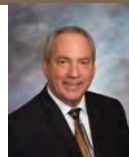
Senator Jeff Monroe (R)