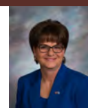
Representative Elizabeth May (R)