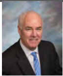
Senator Scott Parsley (D)