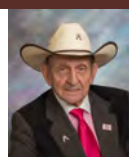
Senator Jim Bradford (D)