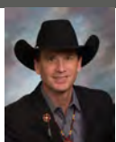
Senator Troy Heinert (D)