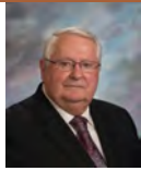
Senator Jim Peterson (D)