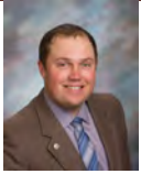
Senator Jason Frerichs (D)