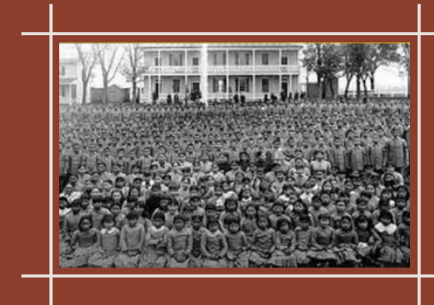
Rapid City Indian Boarding School Grade K-5