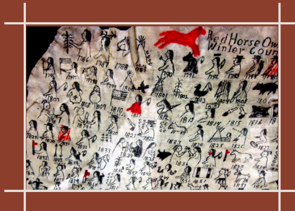
Winter Count Dyes Grade 6-9