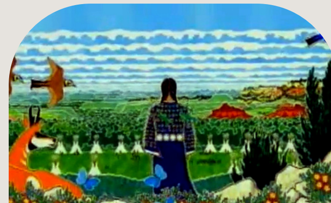
Nellie Two Bulls Grade 9-12