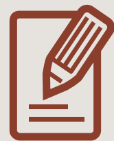
OSEU Aligned South Dakota Social Studies Lessons All Grades