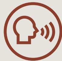
OSEU 7: Vocabulary Connections All Grades